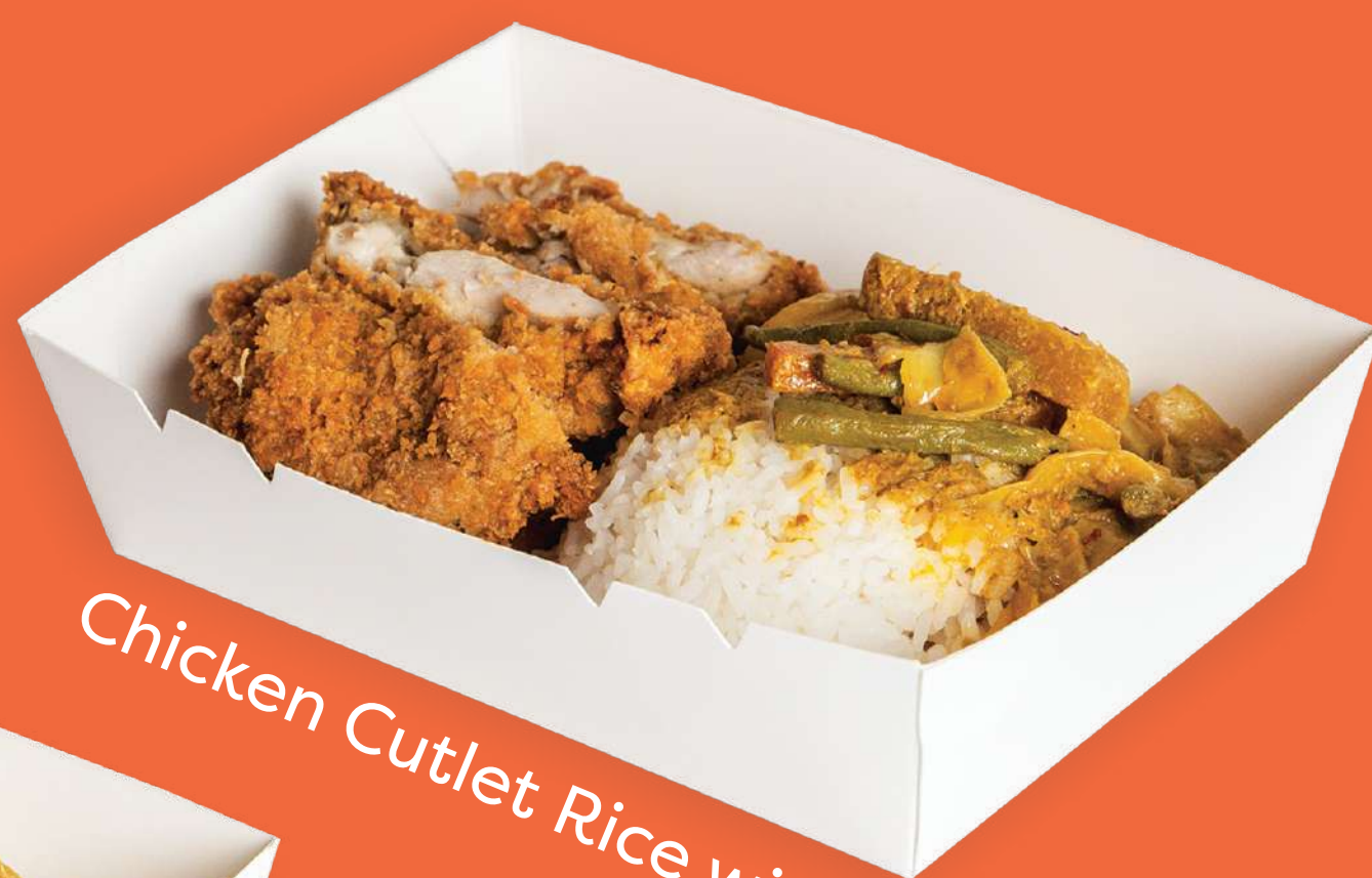
Chicken Cutlet Rice with Curry