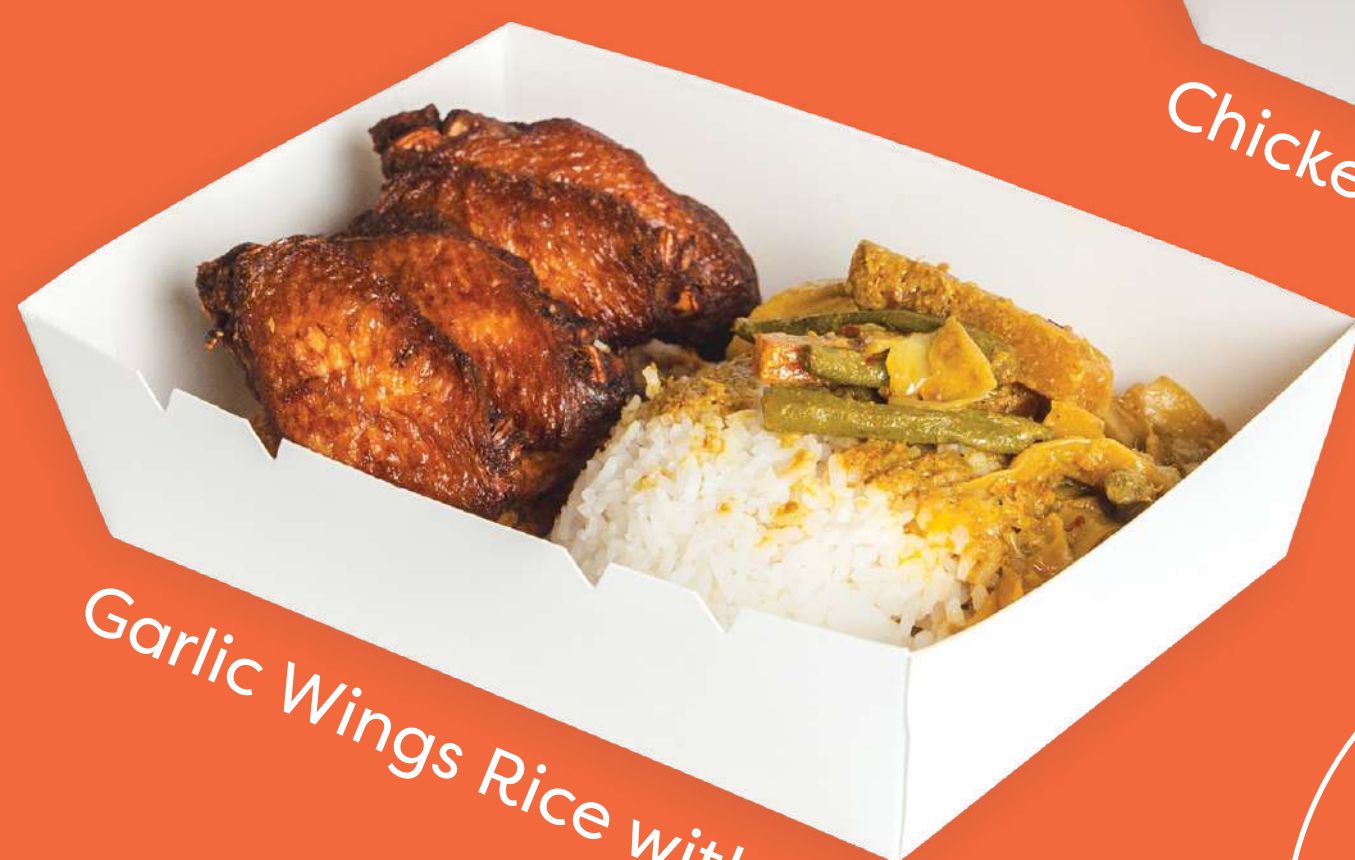
Garlic Wings Rice with Curry